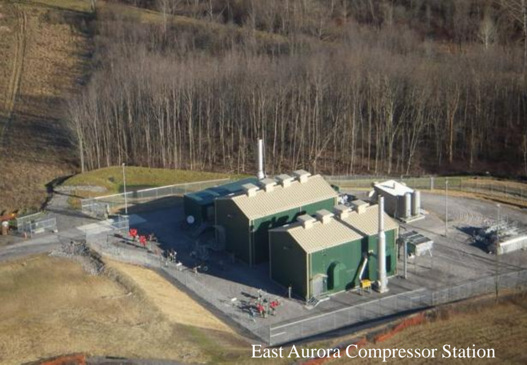
East Aurora Compressor Station